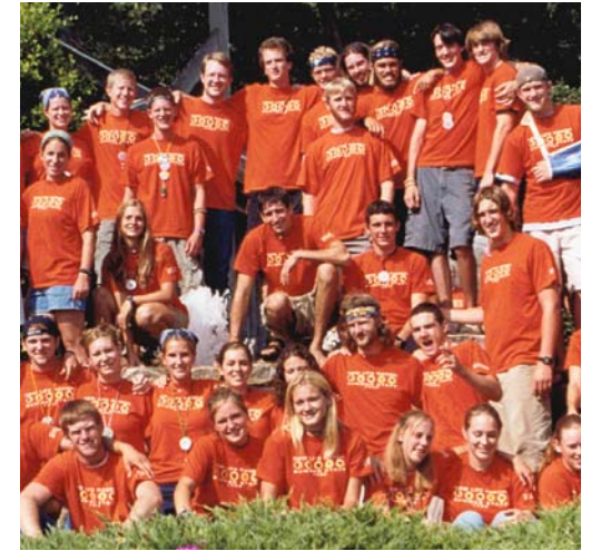
Some of the NLR Summer Staff

Camping is among the most stressful front line ministries of the 21 st century. The hours are long, the needs are great, and the opportunities are many. We need people who care about our ministry and will lift us up in prayer on a regular basis. Jesus said, “For where your treasure is, there your heart will be also” Matthew 6:21. As we invest our money in a ministry, our