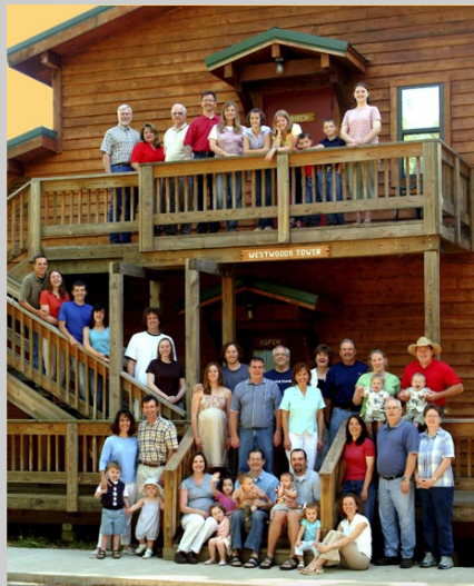
NLR Resident Staff & Families